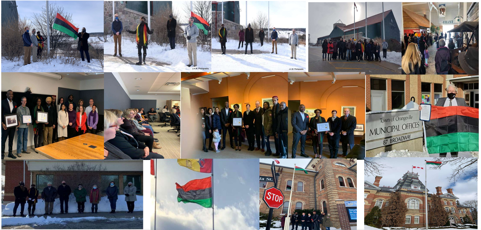
Significant highlights from 2020 to present