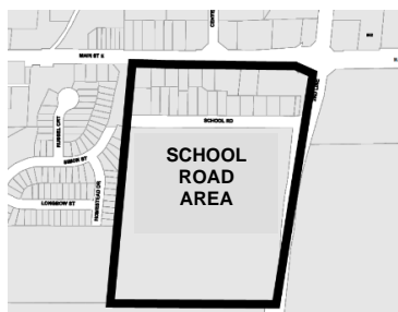
BY-LAW 20-2020 - SCHEDULE C