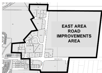
BY-LAW 21-2020 - SCHEDULE C